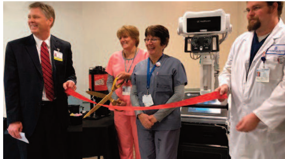
A mobile digital X-ray unit at Fox Hospital was made possible by the generosity of community members.

development chemicals, and no dark room. Images produced digitally can be stored more efficiently, too—on a hard drive rather than taking up physical space. And digital X-rays produce less waste and use less toxic chemicals than conventional X-rays, making the conversion to digital technology beneficial to the entire community.