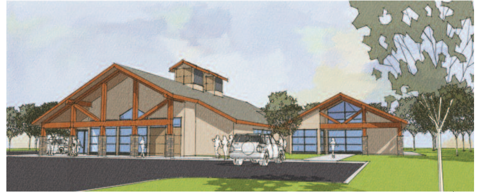
A new primary-care clinic is planned for Dolgeville.

for the purpose of providing space for community health- and wellness-related purposes, such as wellness education and lifestyle-related classes. Major support came from a grant from the F. M. Kirby Foundation, with gifts from the Community Foundation of Herkimer and Oneida Counties and many community members helping to bring compassionate care in a quality environment to residents of the Mohawk Valley.